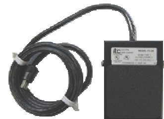
FS-65 Footswitch accessory (purchased separately)