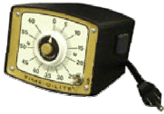
GR-90 Enlarging Timer

Industrial Timer Company 30 Industrial Park Road Centerbrook, CT 06409 800-394-7130 www.industrialtimercompany.com