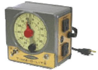
P-72 Professional Timer